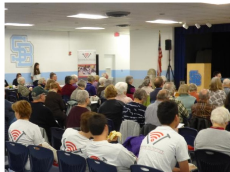
Participants and volunteers listen as Small Dog Electronics employee presents at the Tech Talk 2.0

The Tech Talk 2.0 is a FREE educational workshop for community members that is hosted twice a year by Technology for Tomorrow. If you are interested in learning more about the event or getting on our mailing list, please email: info@tech4tomorrow.org or visit the Technology for Tomorrow website at: www.tech4tomorrow.org .